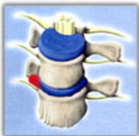
Herniated disc: bulging disc material (indicated in red) causes nerve pressure and severe pain.